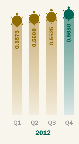
Closing Stock Price (in dollars)